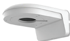
AVM-EWMT-W-TL1 WALL MOUNT