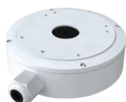
AVM-EDMT-W-TL1 JUNCTION BOX